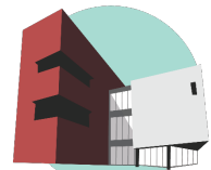
Rochester Art Center