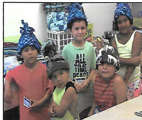
Children of Bdecan Church say “thank you” for donations to their Kids Winter Giveaway!