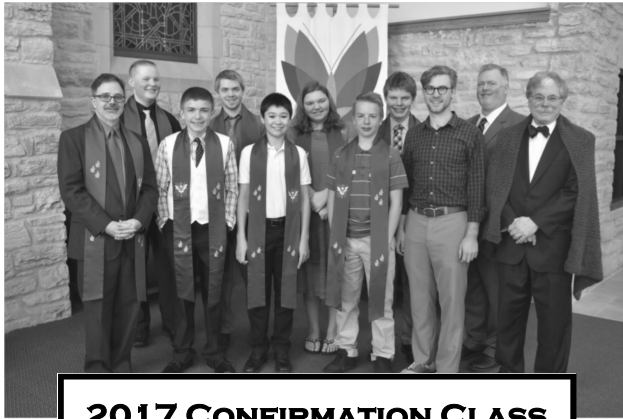
2017 CONFIRMATION CLASS

Additionally, we congratulate the following for the graduation milestones they have accomplished in the past year: