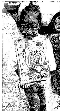
VBS student shows off her butterfly

Returning to North Dakota for the third year, the FPC mission team spent four full days in Tokio on the Spirit Lake Indian Reservation and then worshiped with the members of the First Presbyterian Church there before starting the long trek back across North Dakota and Minnesota on Sunday. I'm sure we'll hear many reports of their adventures there, but for a beginning here are a couple pictures they sent ahead.