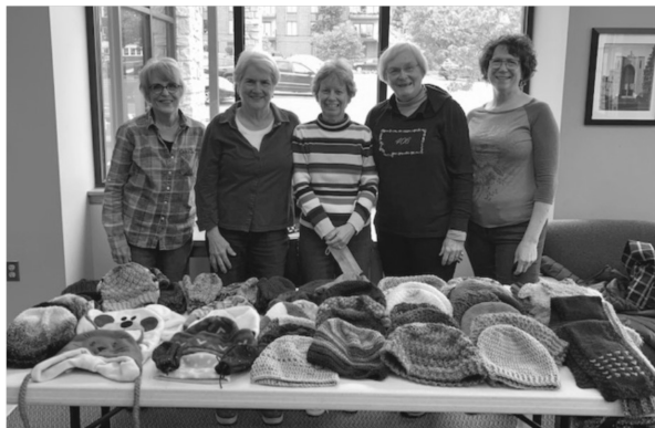
Members of the Prayer Shawl group displaying their donations for the Hawthorne Hills education program.

If you have some health related ideas for the congregation that you would like to partner on, no matter your role, you can reach out to me at fpccparishnursing@gmail.com !